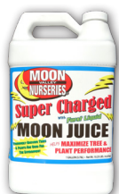
SUPER CHARGED MOON JUICE™