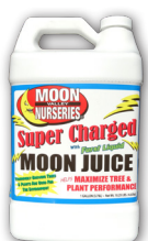
SUPER CHARGED MOON JUICE™