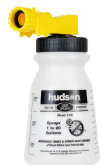
HOSE END SPRAYER

Recommended products are not guaranteed to resolve issue. Always follow all instructions on chemical labels. Call or see store for questions.