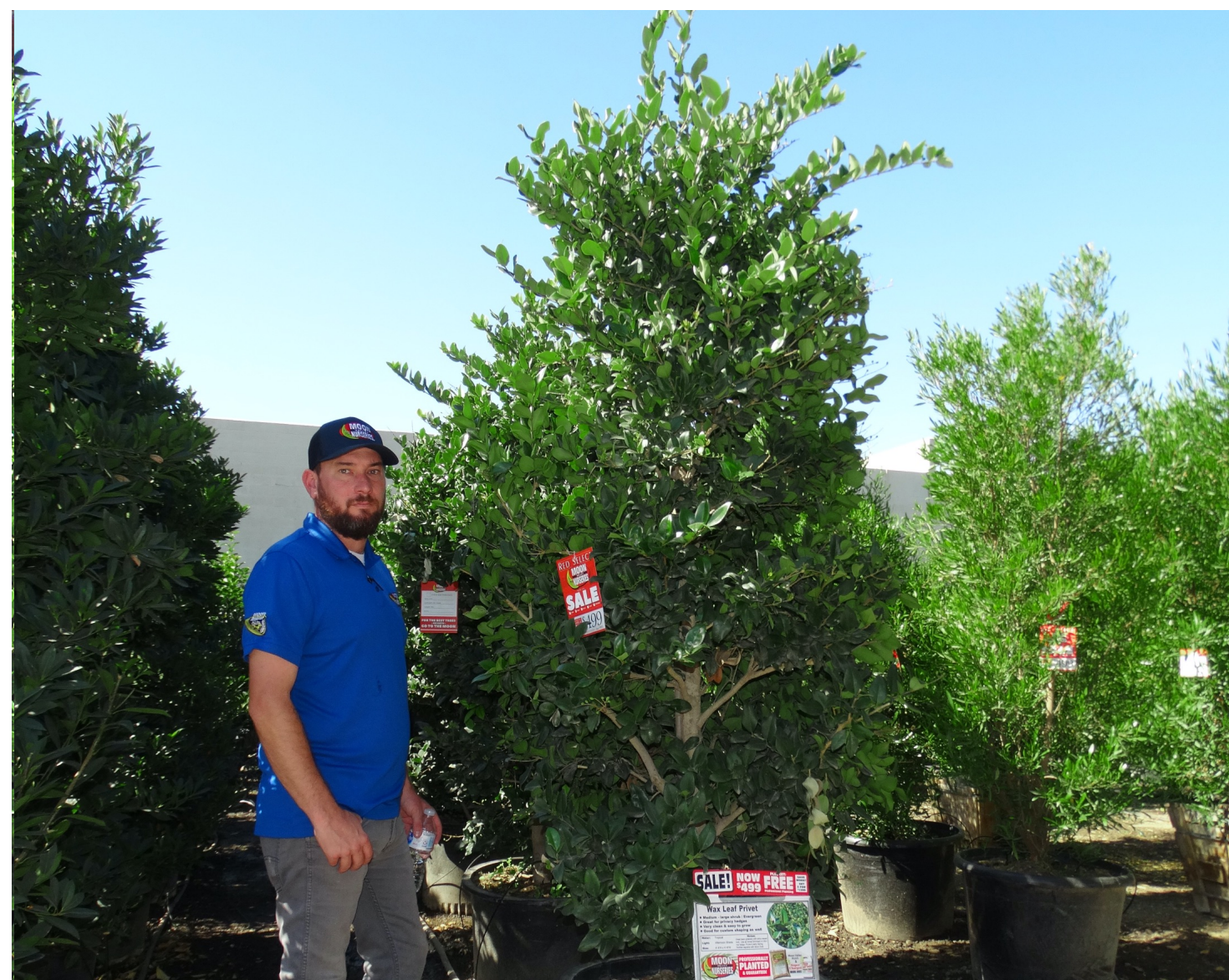
Wax Leaf Privet